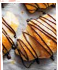
Baked products and pastries