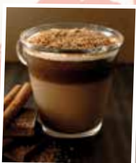
Coffee and hot beverages