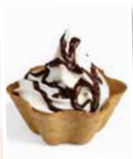
Ice cream and soft yoghurt

Thanks to its smooth taste, it's perfect to top and marble: